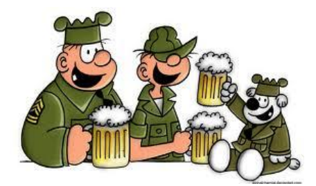
We love Post 96! Come join us!

The Post provides up to 3 hours of free parking in the Isham Street Garage. Bring your parking ticket with you for validation.