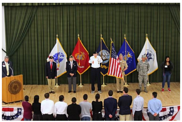
Inductees observe the Generational Passing of the Colors. Class of 2019 Military Inductees Ceremony. May 28, 2019.

Eighteen West Hartford Students were honored at a recognition dinner held by the American Legion and West Hartford Public Schools.