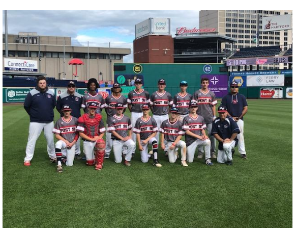
(Dunkin Donuts Park June 14<sup>th</sup>.)

15U <a href="https://www.hometeamsonline.com/teams/default.asp?u=WESTHARTFORD&s=baseball&p=schedule">https://www.hometeamsonline.com/teams/default.asp?u=WESTHARTFORD&s=baseball&p=schedule</a>