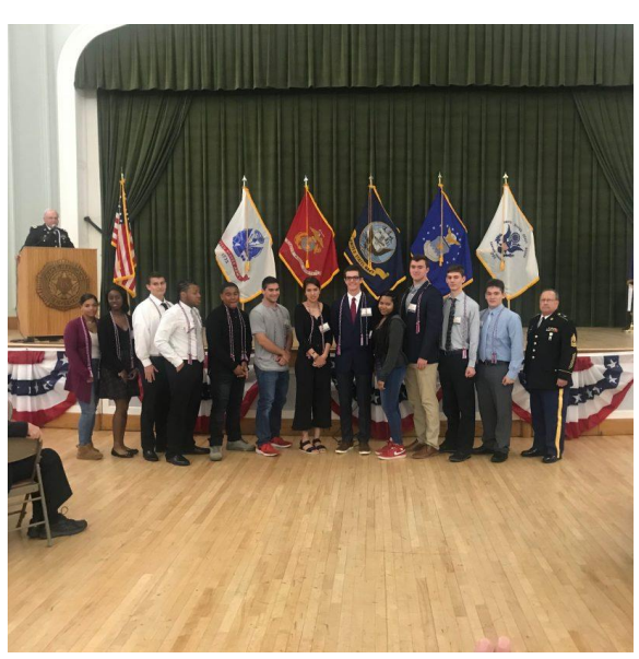
Class of 2019 Military Inductees Ceremony. May 28, 2019.