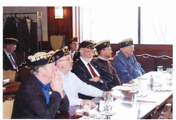
Post 96 members at luncheon with National Commander Koutz.

Commander Koutz also discussed other organizations promoting the support of veterans. He was not supportive of the Wounded Warrior Project because of the disproportionate allocation to administrative overhead and not to veterans. He was supportive of programs such as Fisher House. After his visit to Hayes-Velhage Post 96 Commander Koutz was scheduled to meet with VA representatives in Newington to discuss the backlog in VA claims.