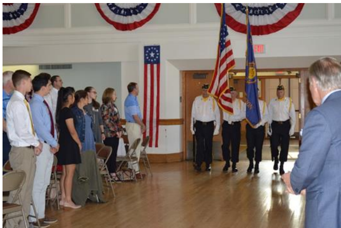
Posting of Colors