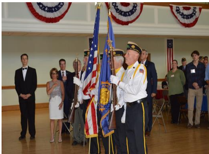
Posting of Colors