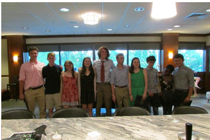
(Orientation night for Boys State and Girls State)