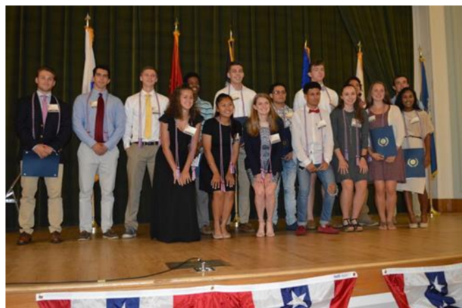
2018 Military Inductees